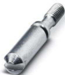
Coding peg for coding up to 16 connectors, for HC Modular

Please be informed that the data shown in this PDF Document is generated from our Online Catalog. Please find the complete data in the user's documentation. Our General Terms of Use for Downloads are valid ( http://phoenixcontact.com/download )