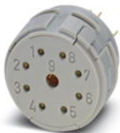
Contact insert, number of positions: 6+3, type of contact: Socket, Solder connection

Please be informed that the data shown in this PDF Document is generated from our Online Catalog. Please find the complete data in the user's documentation. Our General Terms of Use for Downloads are valid ( http://phoenixcontact.com/download )