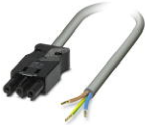
Power cable, 3-position, PVC, gray RAL 7001, free cable end, on Socket straight, black, Cable length: 3 m

Please be informed that the data shown in this PDF Document is generated from our Online Catalog. Please find the complete data in the user's documentation. Our General Terms of Use for Downloads are valid ( http://phoenixcontact.com/download )