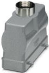
HEAVYCON B24 sleeve housing, for double locking latch, height: 76 mm, with 1 x Pg21 gland, straight cable outlet

Please be informed that the data shown in this PDF Document is generated from our Online Catalog. Please find the complete data in the user's documentation. Our General Terms of Use for Downloads are valid ( http://phoenixcontact.com/download )