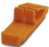
Latching, Number of positions: 2, Color: orange