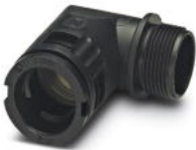
Cable gland, Pg thread, IP68/69k protection, angled

Please be informed that the data shown in this PDF Document is generated from our Online Catalog. Please find the complete data in the user's documentation. Our General Terms of Use for Downloads are valid ( http://phoenixcontact.com/download )