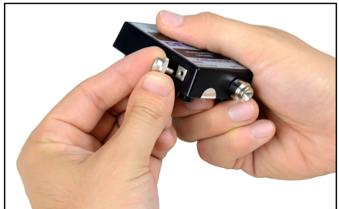
Figure 7. Changing the park snap on the 19243 Mini Monitor

The 19243 Mini Monitor includes an interchangeable 10mm park snap and 10mm banana jack adapter for operators who use wrist cords with 10mm terminations. Use the park snaps' knurled rims to unscrew the 4mm park snap from the monitor and install the 10mm park snap to the monitor. Plug the 10mm operator jack adapter into the monitor's operator jack.