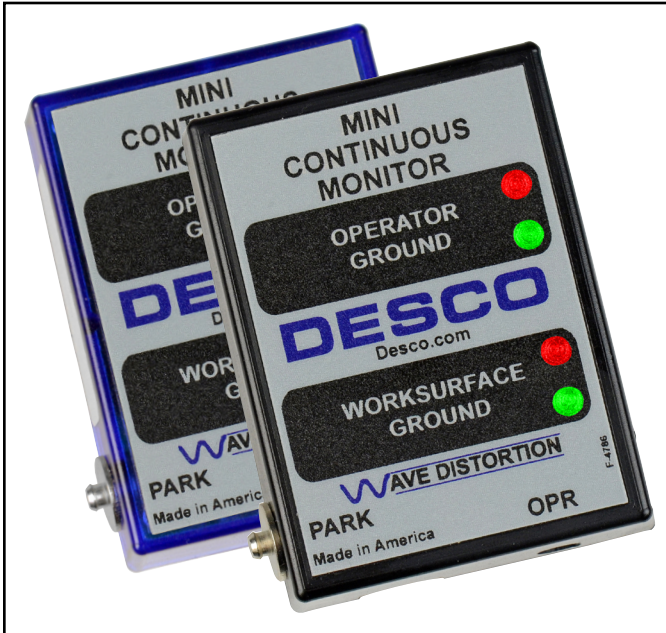
Figure 1. Desco Mini Monitor