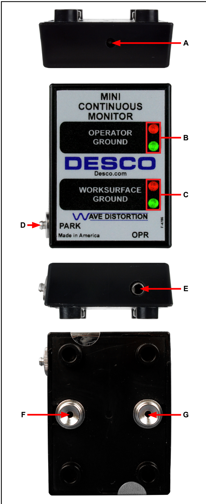
Figure 4. Mini Monitor features and components

A. Power Jack: Connect the included 24VDC power adapter here.