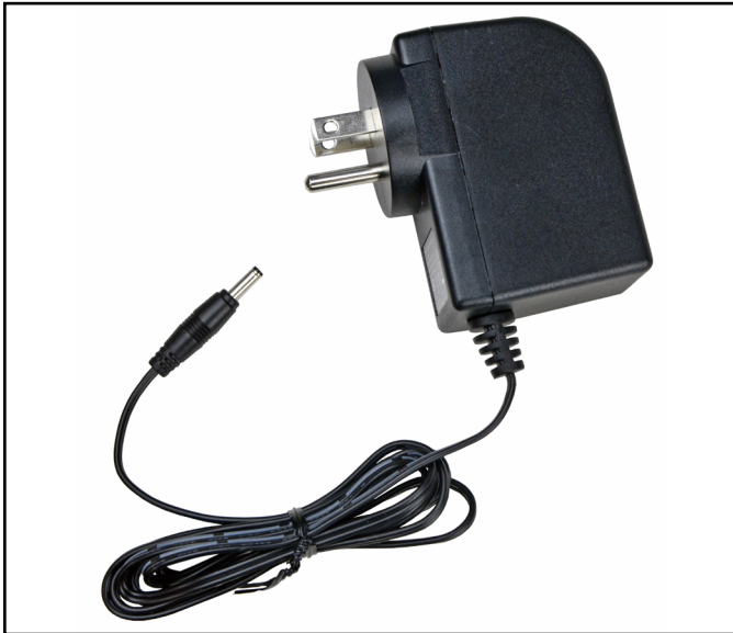
Figure 2. North American power adapter included with the 19239 and 19242 Mini Monitors