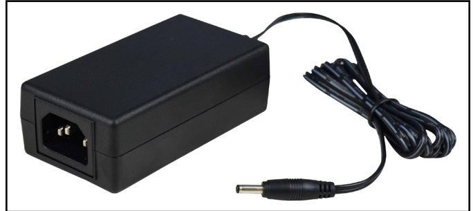
Figure 3. Universal power adapter included with the 19243 Mini Monitor

NOTE: The power cord must be purchased separately if ordering the 19243 Mini Monitor. The power cords are available as the following item numbers: