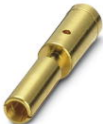
Crimp contact, turned, contact diameter: 1 mm, crimp range: 1 mm 2 ... 1.5 mm 2

Please be informed that the data shown in this PDF Document is generated from our Online Catalog. Please find the complete data in the user's documentation. Our General Terms of Use for Downloads are valid ( http://phoenixcontact.com/download )