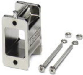
Spacer for panel mounting frames

Please be informed that the data shown in this PDF Document is generated from our Online Catalog. Please find the complete data in the user's documentation. Our General Terms of Use for Downloads are valid ( http://phoenixcontact.com/download )