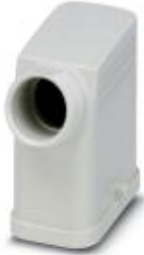
Sleeve housing for single locking engagement nose, lateral cable outlet, for HC-COM-K-KV-PG16 screw connections...

Please be informed that the data shown in this PDF Document is generated from our Online Catalog. Please find the complete data in the user's documentation. Our General Terms of Use for Downloads are valid ( http://download.phoenixcontact.com )