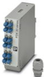
DIN rail splice box, fully mounted ready to splice, for 6x ST duplex (OS2)

Please be informed that the data shown in this PDF Document is generated from our Online Catalog. Please find the complete data in the user's documentation. Our General Terms of Use for Downloads are valid ( http://phoenixcontact.com/download )