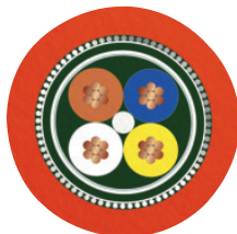
Sercos III [93K]