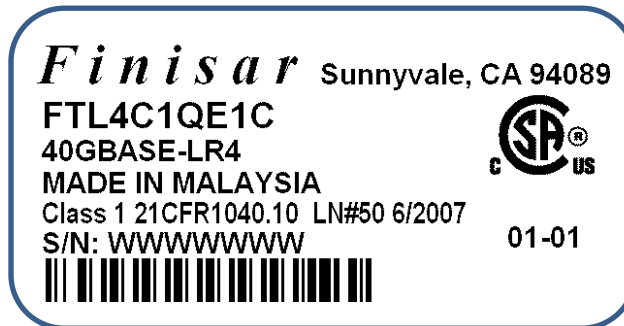
Figure 3 – FTL4C1QL1L production label