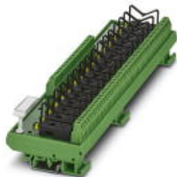
VARIOFACE module, for 16 plug-in miniature relays or miniature optocouplers, with LED, 24 V DC input voltage

Please be informed that the data shown in this PDF Document is generated from our Online Catalog. Please find the complete data in the user's documentation. Our General Terms of Use for Downloads are valid ( http://phoenixcontact.com/download )