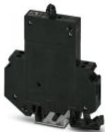
Thermomagnetic circuit breaker, 1-pos., normal blow, 1 N/O contact, with universal foot for mounting on NS 32 or NS 35

Please be informed that the data shown in this PDF Document is generated from our Online Catalog. Please find the complete data in the user's documentation. Our General Terms of Use for Downloads are valid ( http://phoenixcontact.com/download )