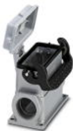
Box mounting base, with single locking latch, height: 74 mm, with gland, 1 x Pg29, with protective cover

Please be informed that the data shown in this PDF Document is generated from our Online Catalog. Please find the complete data in the user's documentation. Our General Terms of Use for Downloads are valid ( http://phoenixcontact.com/download )