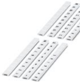
Zack marker strip flat, 10-section, horizontally labeled with the consecutive numbers: 21 ... 30, white

Please be informed that the data shown in this PDF Document is generated from our Online Catalog. Please find the complete data in the user's documentation. Our General Terms of Use for Downloads are valid ( http://phoenixcontact.com/download )