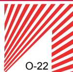
Solder Pad Layout