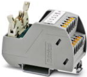
VARIOFACE Professional (VIP) board for the ROC800 controller

Please be informed that the data shown in this PDF Document is generated from our Online Catalog. Please find the complete data in the user's documentation. Our General Terms of Use for Downloads are valid ( http://phoenixcontact.com/download )