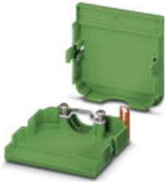
Cable housing, Pitch: 0 mm, Number of positions: 15, Dimension a: 59.54 mm, Color: green

Please be informed that the data shown in this PDF Document is generated from our Online Catalog. Please find the complete data in the user's documentation. Our General Terms of Use for Downloads are valid ( http://download.phoenixcontact.com )