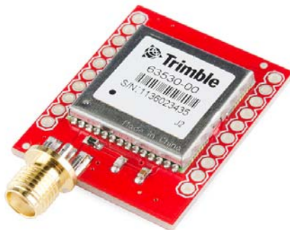
The Copernicus II DIP Module

The module supports NMEA, TSIP and TAIP protocols at 1 Hz. The board also is designed to interface with an SMA antenna.