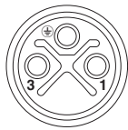
Pin assignment of M12 socket, 3-pos., S-coded, socket side view