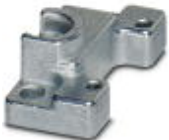
Panel mounting flange for HEAVYCON-ADVANCE TMS housing with screw locking